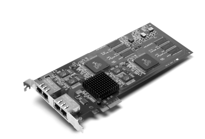
Figure 3: PCIe Based Accelerators

Figure 3 shows PCIe based Accelerators. LEDs show link status, activity and speed on the end bracket: